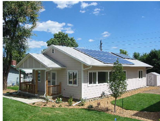
HABITAT FOR HUMANITY, WHEAT RIDGE, COLORADO